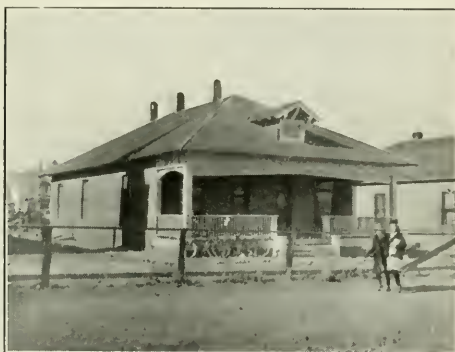
FIRST, MAGDALENA, N. M. (Manse)